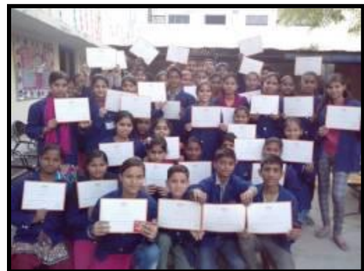
Students receiving participation Certificate