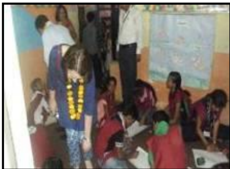
Ms. Claire observing the activities

80 students were involved in the activities and they performed the same.