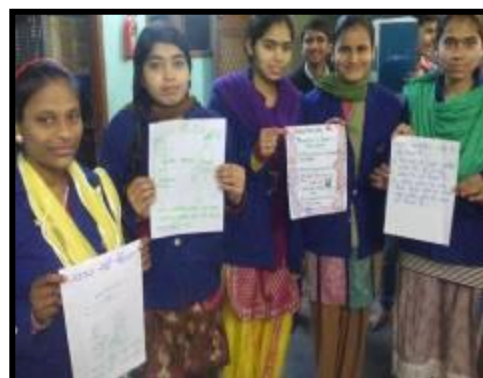
Students making posters and displaying them