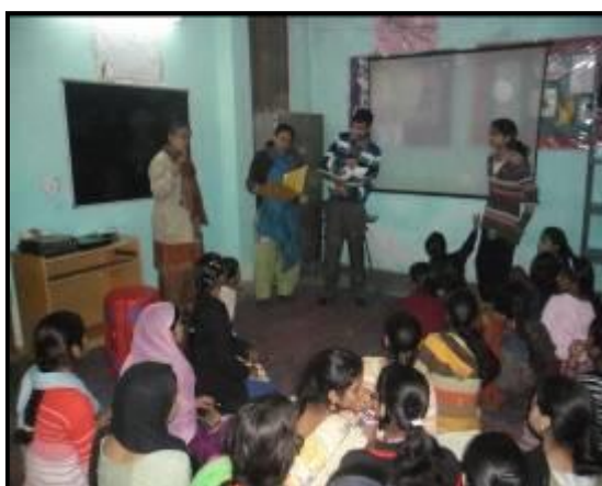
Workshop with parents

By the year 2014-15 Khushii has been successfully spread its project by their services under the wings of Swatantra Shikshaantra and set up 6 tributary schools in the areas of Sangam Vihar and Devli village. This will result in extensive outreach in terms of providing education at the door steps of the poor students. Each tributary school has 175- 225 students from the nearby community with the replication of the process and proceedings of Shikshaantra.