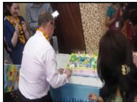
Inauguration ceremony was done by cake cutting