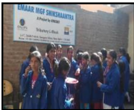
Students in celebration mood during Holi