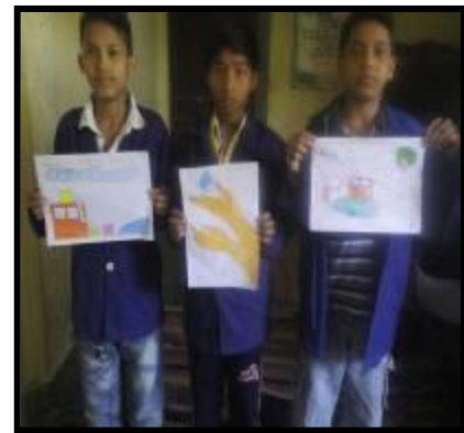
Students exhibiting their work