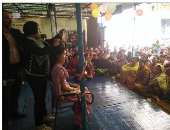
Hair stylist from VLCC demonstrating participants beautiful hair style on women's day.