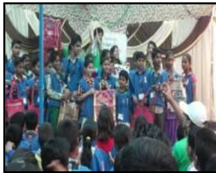
Team displaying the bags

All the students from this group talked on the different festivals and also described the festivals through charts.