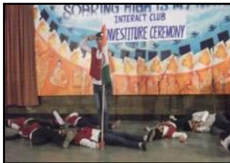
Khushii students performing group dance on patriotic song