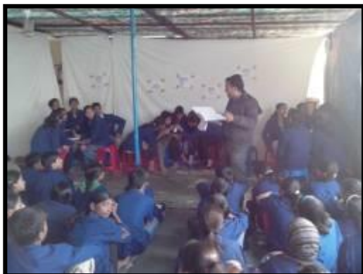
Quiz on First Aid in Progress