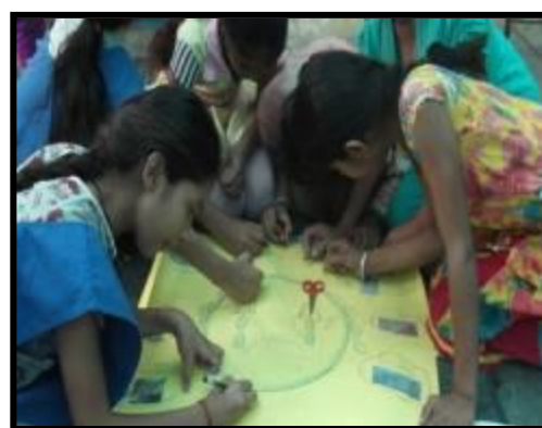
Students at work