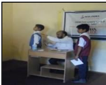
Check up of a student in progress

An Immunization programme is being conducted in schools of Khushii since 2012 in collaboration with MAX India Foundation. In this year 661 beneficiaries have benefitted out of which 582 were immunized with Hepatitis – B vaccine and 79 with Typhoid vaccine.