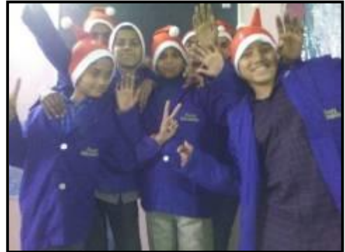
Students in celebration Mood