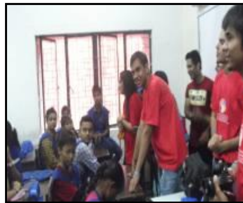
Students listening to the volunteers