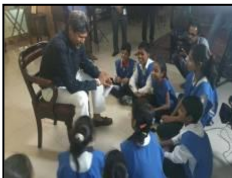
Mr. Kapil Dev interacting with students