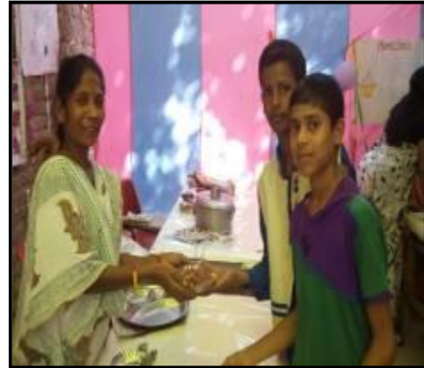
Enjoying the Mela