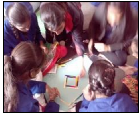
Children enjoying activity

Swachh Bharat Abhiyan or Clean Indian Mission is a national level campaign by the Government of India. To join the movement, on 21st December 2014 a rally was taken out in the areas of Devli and Sangam Vihar. Total 150 students and all staff members of KHUSHII participated. The aim of this rally was to motivate and inspire locals to join the movement and keep their area neat and clean. Few dirty and filthy areas were also cleaned during the rally.