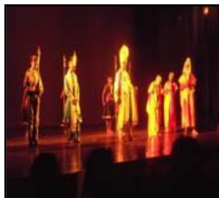
Beneficiary from Jamghat performing theater