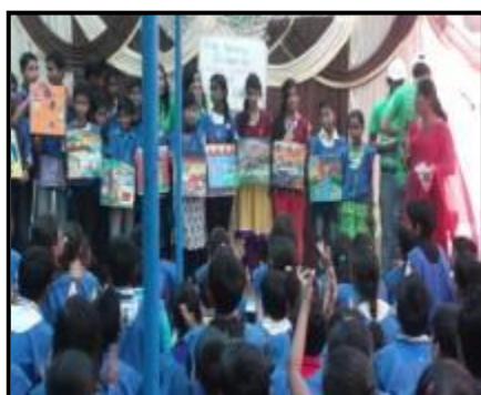
Volunteers from XL and Shikshaantra students displaying their Canvas painting

There was an interactive session between volunteers and beneficiaries. All the students and volunteers did painting on the canvas where they had put their expression.