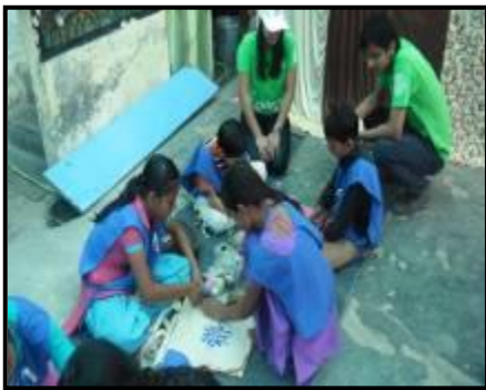
Children & volunteers making jute bags