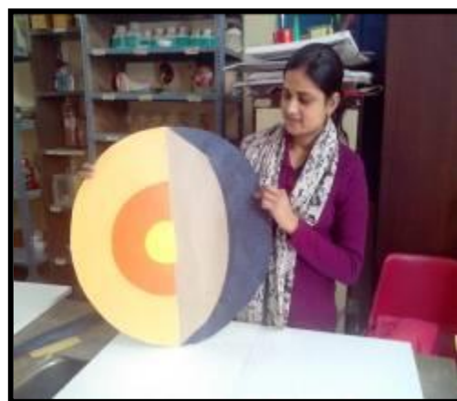
Teachers making their TLM