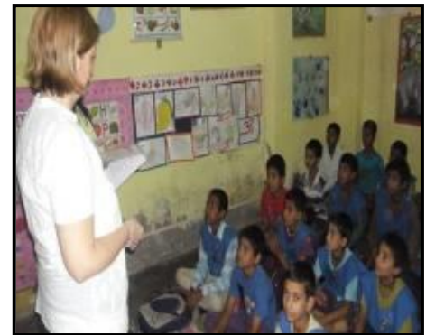
Volunteers interacting with students