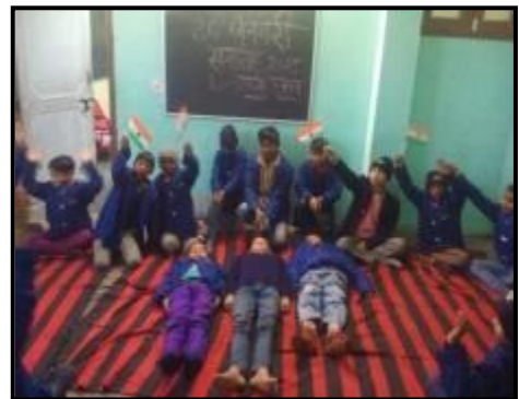
Celebrations in progress