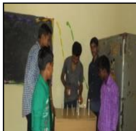
Students enjoying the fair