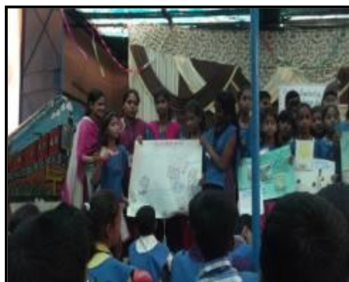
Students exhibiting their work