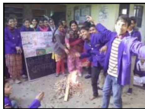
Students dancing around Bonfire