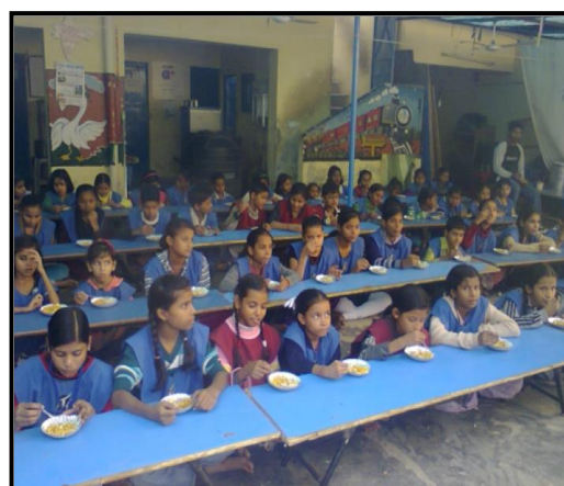
Students enjoying nutritious Mid day Meal