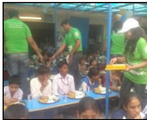
Team of XL, Group serving mid day meal to the students