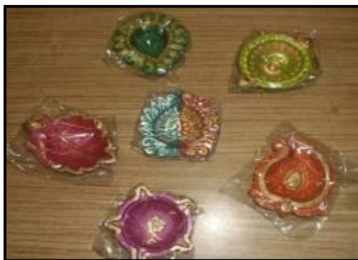
Glimpse of painted Diyas