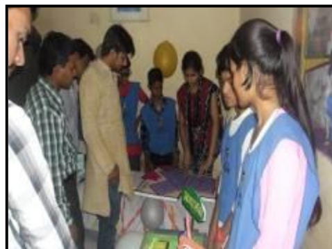
Glimpse of Fair held in Devli School