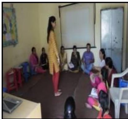
Ice breaking session in progress

Case study plays an integral part in any school program. Therefore, perfect information of students in case study is very important as it provides you a glimpse of the life of that child. A training of teachers on case study format was conducted on 20th September 2014 from 11.00AM to 1.00 PM by Ms. Sheetal Tyagi with all teachers. In this training entire case study format was explained and information teachers should sought while writing was also shared in detail.