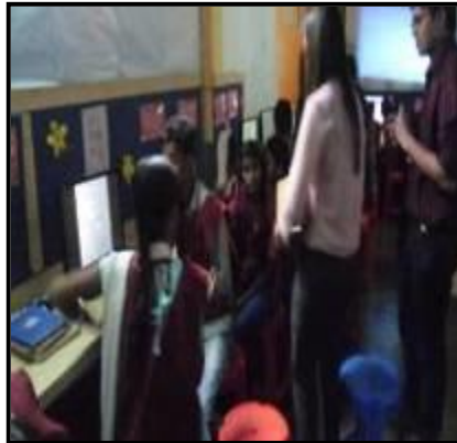
Volunteers from RBS taking computer literacy classes