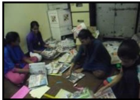
Workshop in progress