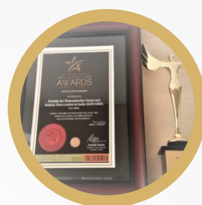
National Excellence Award for Outstanding Contribution to Society Alma London, United Kingdom 2017