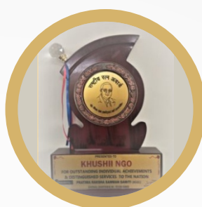
Rashtriya Ratan Award for Social Change Pratima Raksha Samman Samiti, Karnal 2017